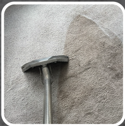
Carpet & Rug Cleaning