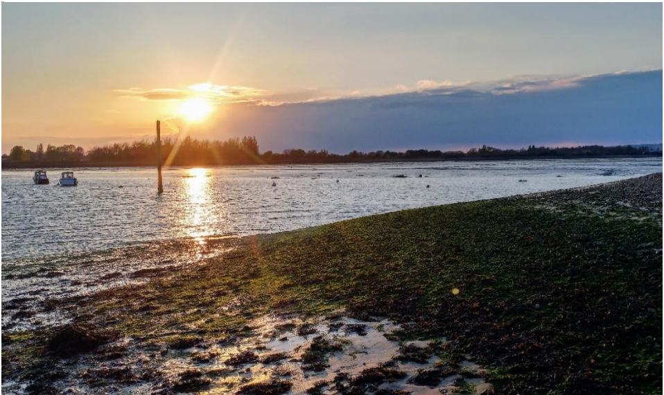
Sunset Over Milton Common

Picnic On The Green, Saturday 1 st Jun 1-5pm