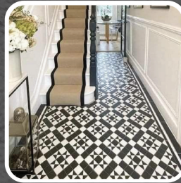
Stone and Tile Restoration